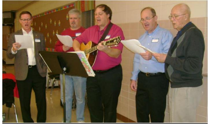
Talented Entertainment at our annual Christmas Party